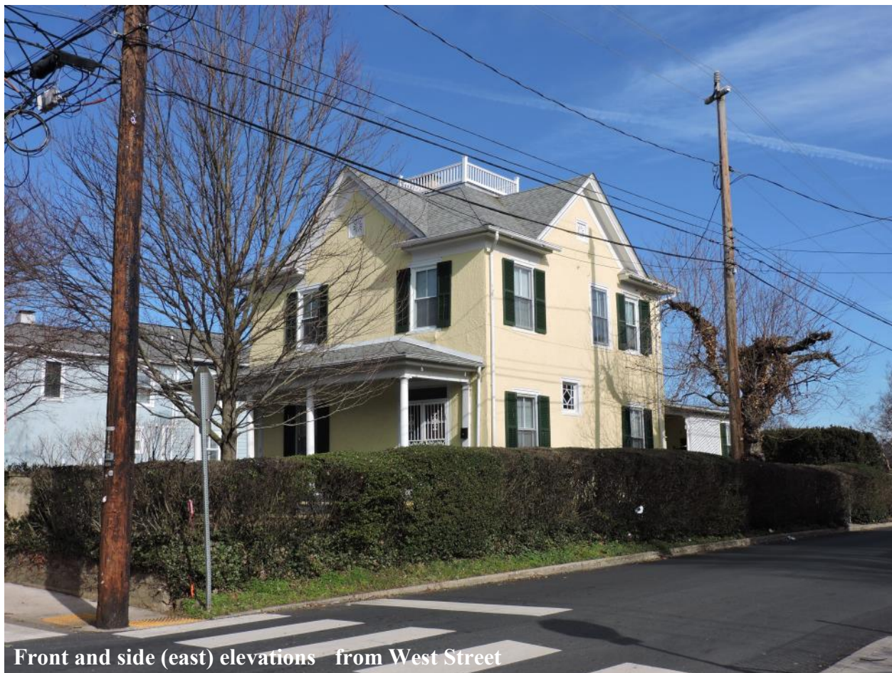
Front and side (east) elevations - from West Street