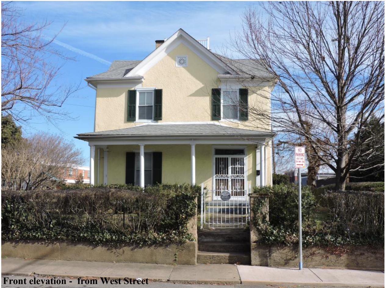
Front elevation - from West Street