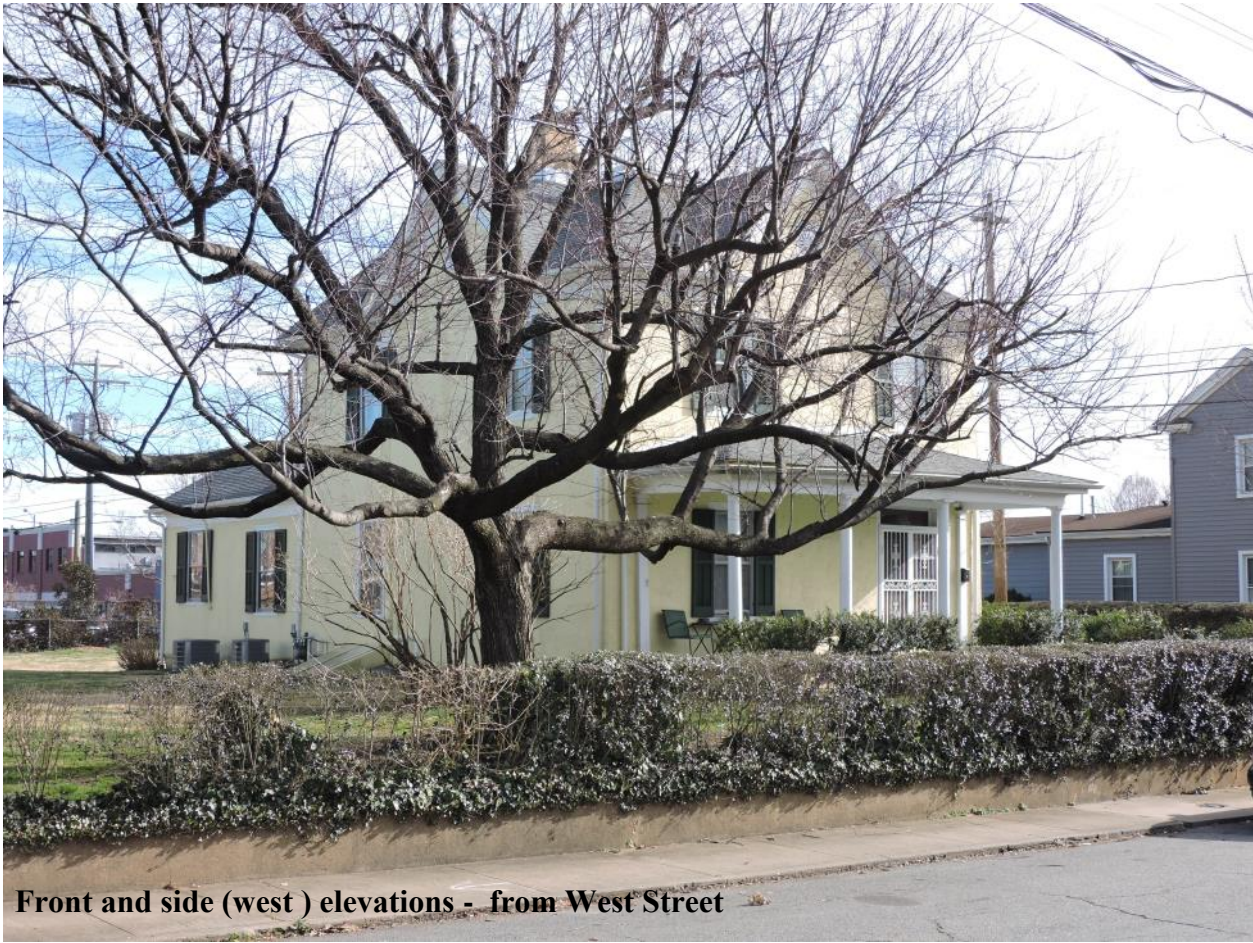
Front and side (west) elevations - from West Street