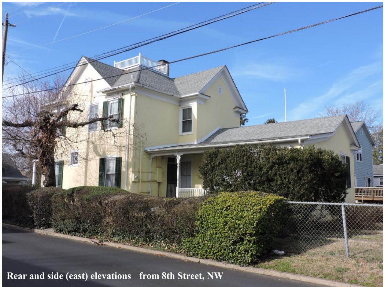
Rear and side (east) elevations from 8th Street, NW